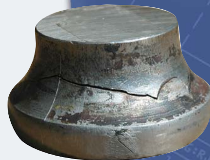
Transverse crack in Rod Head

Cracks in rigging components, especially cracks that are orientated transverse to the load, are a sign of impending failure. Cracks can be found using visual inspection, a magnifier, or by dye penetrate testing. Navtec recommends these techniques, but other professional testing techniques available are X-ray testing, eddy current testing and ultrasonic testing, which allows you to inspect rod heads for transverse cracks in closed fittings.