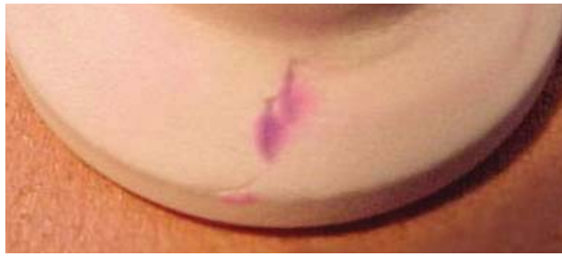
EXPOSED CRACK USING DIE PENETRATE TEST

For visual inspection, the rod or fittings must be cleaned or polished to expose the cracks. Rusty areas frequently indicate cracks underneath. In addition to cracks, you should look for corrosion, pitting, black streaks, rust and visible wear. Any areas showing discoloration or potential corrosion should be thoroughly cleaned and inspected. If any evidence of pitting, corrosion or wear remains after this cleaning, please consult an authorized Navtec service agent. Pitting, corrosion or visible wear could require re-heading, replacement of the rod or replacement of associated fittings.