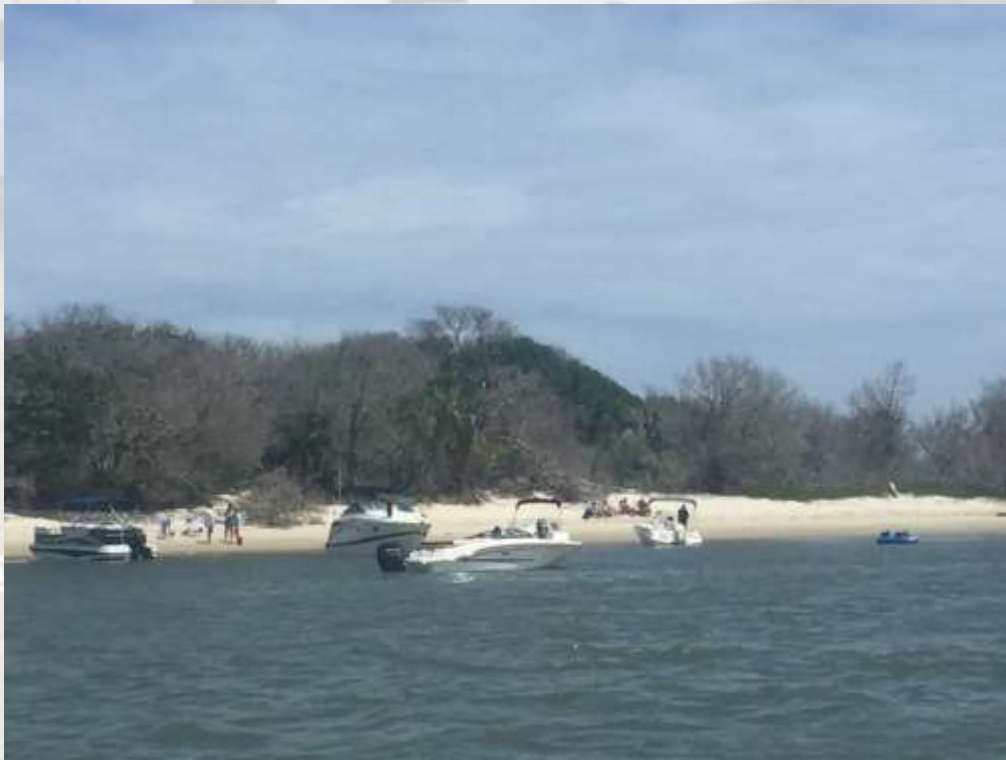
4 dolphins came by in the morning heading out to the ocean.