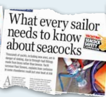
JUNE 2011 What on earth are we doing using an inferior material for vital fittings below the waterline? A five year service life is not acceptable