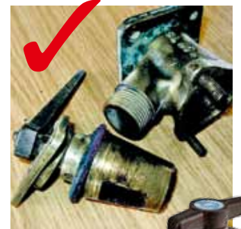
ABOVE: Blake's bronze seacocks are recommended RIGHT: Marelon plastic seacocks are increasingly popular

For 'Essential seacock checks' visit our website ( www.yachtingmonthly.com ) and click on YM PLUS