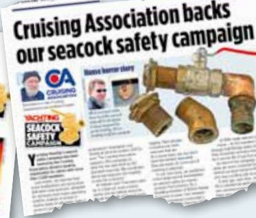
JULY 2011 YM's campaign is backed by the Cruising Association, Britain's leading organisation for sailors with more than 3,500 members