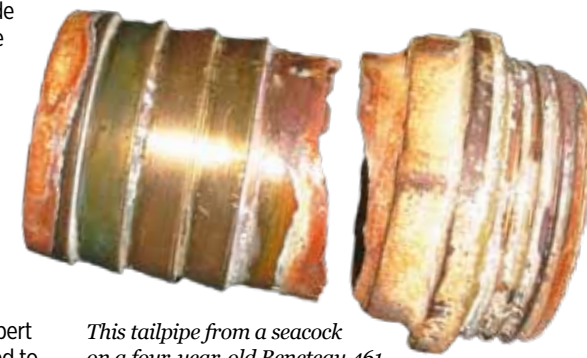
This tailpipe from a seacock on a four-year-old Beneteau 461 sheared off at the inboard end